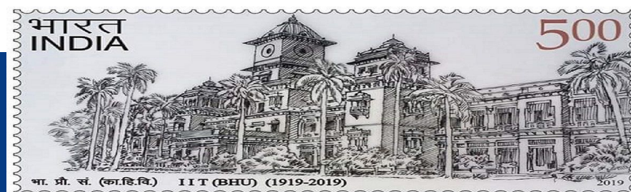
Commemorative stamp on the completion of 100 years of institute released by the Hon'ble PM

It conducts short-term courses, training courses, seminars, workshops and conferences for enrichment in quality of students and entrepreneurs. The department has its own Civil Engineering Society which is dedicated in organising lectures by various experts in their respective field, group discussions, competitions, sports and various other extra-curricular and cultural activities so that there would be an holistic all round development of students. Also this society conducts a separate fest for the Civil Engineering Students, known as, Shilp.